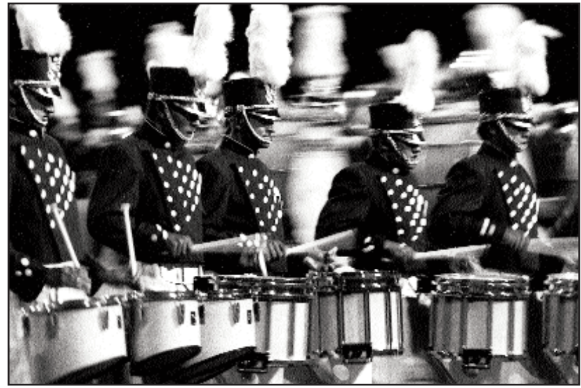
(Above) Blue Knights, 1991, at the DCI Championships in Dallas, TX; (below) Blue Knights, 1983.

his or her own drum, with Fred providing a bass drum and a pair of cymbals from the school. A very small bugle section, directed by Young, played on borrowed brass bugles. Uniforms were makeshift and often didn't precisely match. but that was secondary to the chance to march down the street in front of a crowd. Back in those