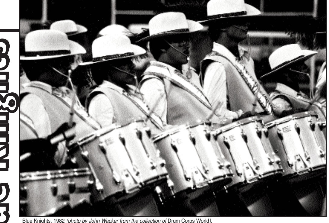
Blue Knights, 1982