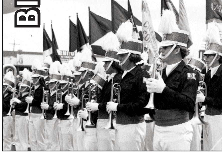
Blue Knights, 1972 (photo from the collection of Drum Corps World).

Fae Talent School, which provided their many followers a chance to receive voice and instrumental music lessons from the popular d110