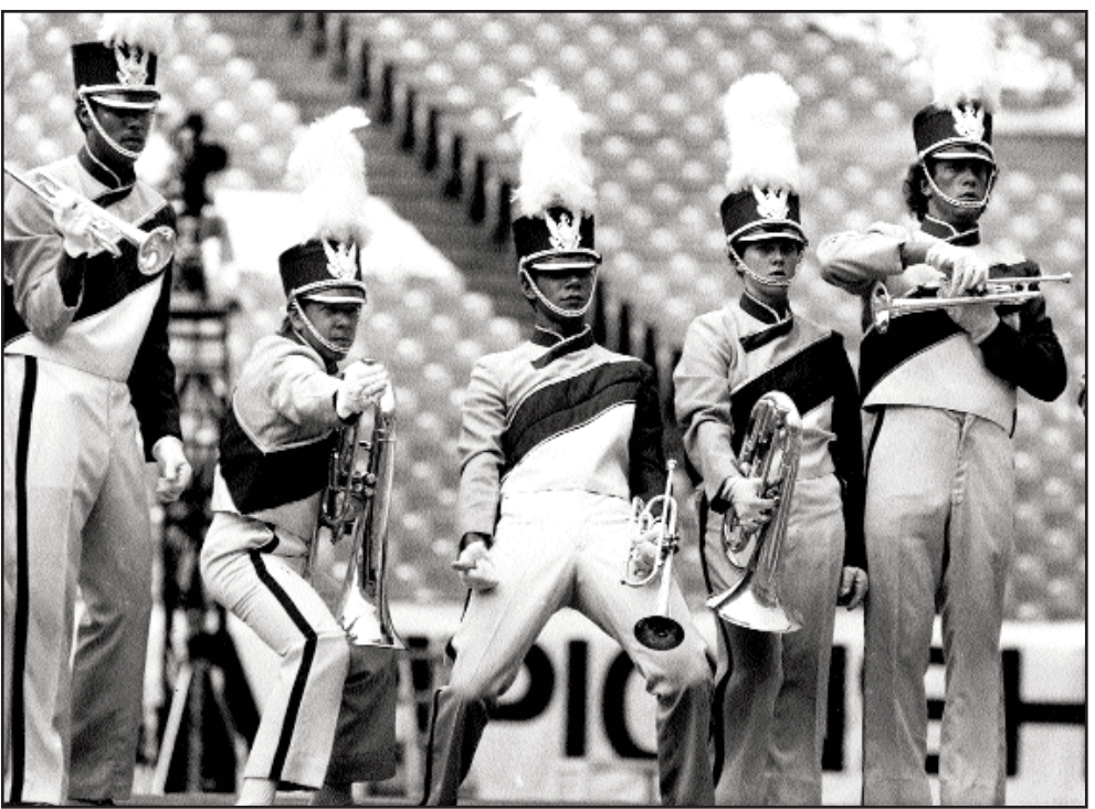
Blue Knights, 1988, at DCI Championships in Kansas City, MO.